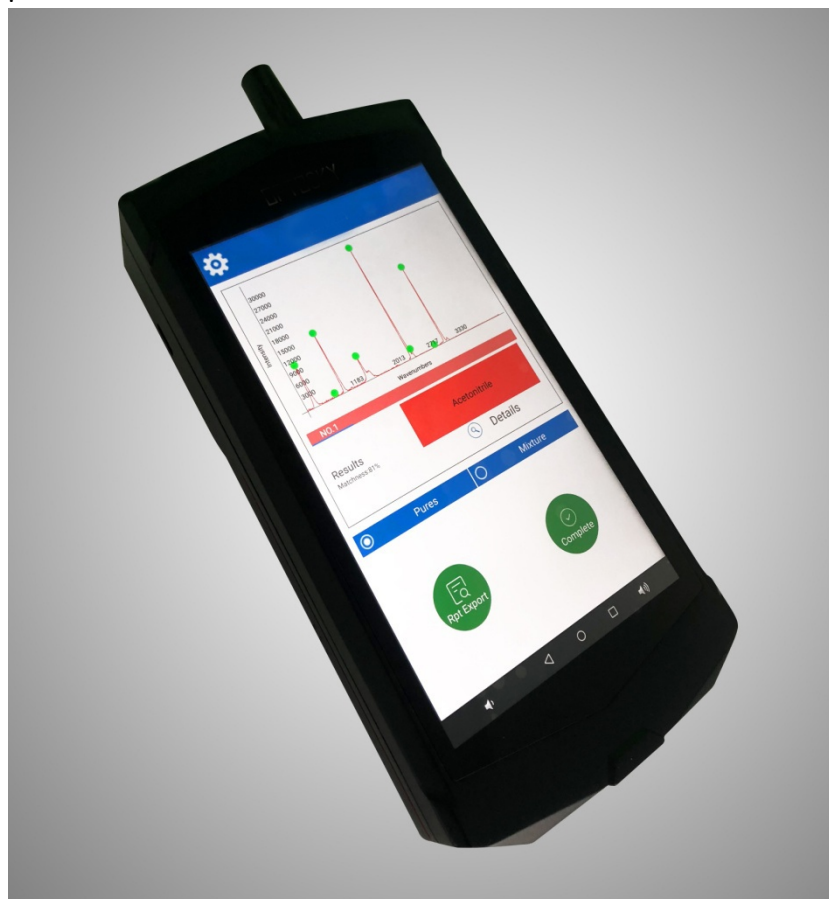
The unique Laserspec hand held Raman laboratory with 1064nm