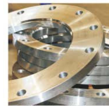
Quality control on industrial products

EXPLORER 5000 professional and nondestructive detection can be used for quality control and management in the manufacturing process of steel smelting, boiler industry and other high-temperature and high-pressure industries to ensure the materials quality, identification of alloy composition in shipbuilding, aerospace and other high-tech industries in order to ensure product quality and safety; identification on the quality of the spare parts in electric power plants and other industries related to people's livelihood to guarantee the equipment safety.