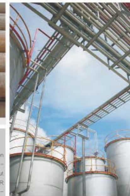
Quality assurance and control

In the process of alloy materials production and machinery manufacturing and processing, elements detection can't work without the identification of materials. EXPLORER 5000 professional and nondestructive detection can effectively prevent the mix of raw material and avoid unnecessary loss.