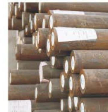
Raw materials testing